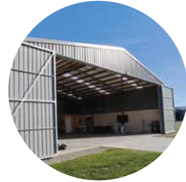
Hangars and umbrellas works