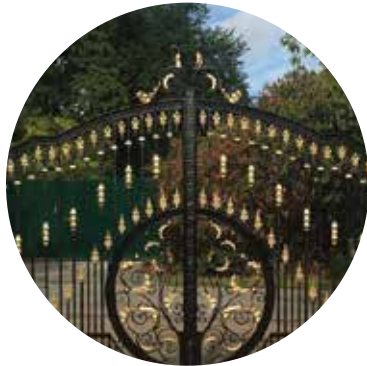
IRON GATES AND NET FENCING